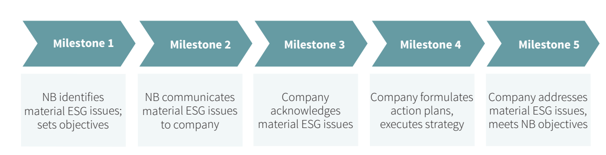
Chart 3: Engagement Milestone System

9 Japan Exchange Group and Tokyo Stock Exchange, "Practical Handbook for ESG Disclosure" (March 2020) (Japanese version).